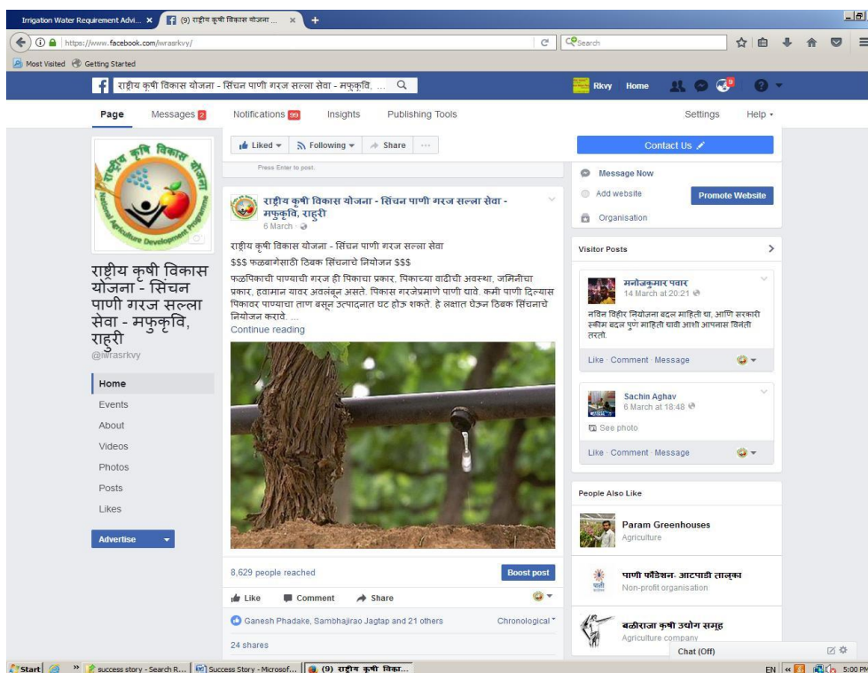
Home screen of facebook group