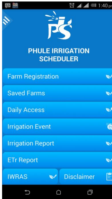
Home screen of “Phule Irrigation Scheduler” mobile application